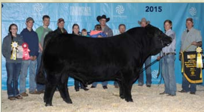
KSIX Wingman 2A Reserve National champion and Agribition Champion Maine Bull. Sired by Fighting Irish & bred by us. Congrats Hansen Livestock!

Solid black polled Maine bulls for sale private treaty Sired by BFW Fighting Irish 22U, BPF Middle Man 511A and Rapid Creek's Copenhagen 500Z