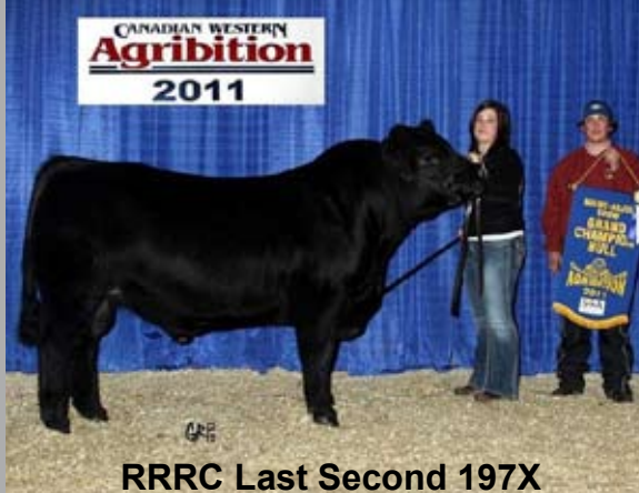
RRRC Last Second 197X 3 time qualifier for the 2011 CWA Beef Supreme SEMEN AVAILABLE