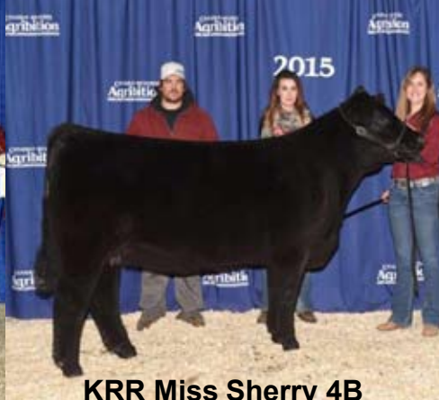
KRR Miss Sherry 4B Champion Maine Anjou, First Lady Classic Sired by RRRC Last Second 197X SOLD to Hansen Livestock