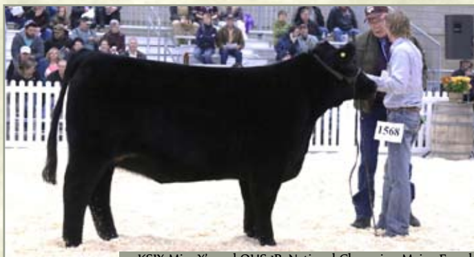
KSIX Miss X's and OHS 1B. National Champion Maine Female. Dam sold in our 2010 sale. Congrats Konnect 6!