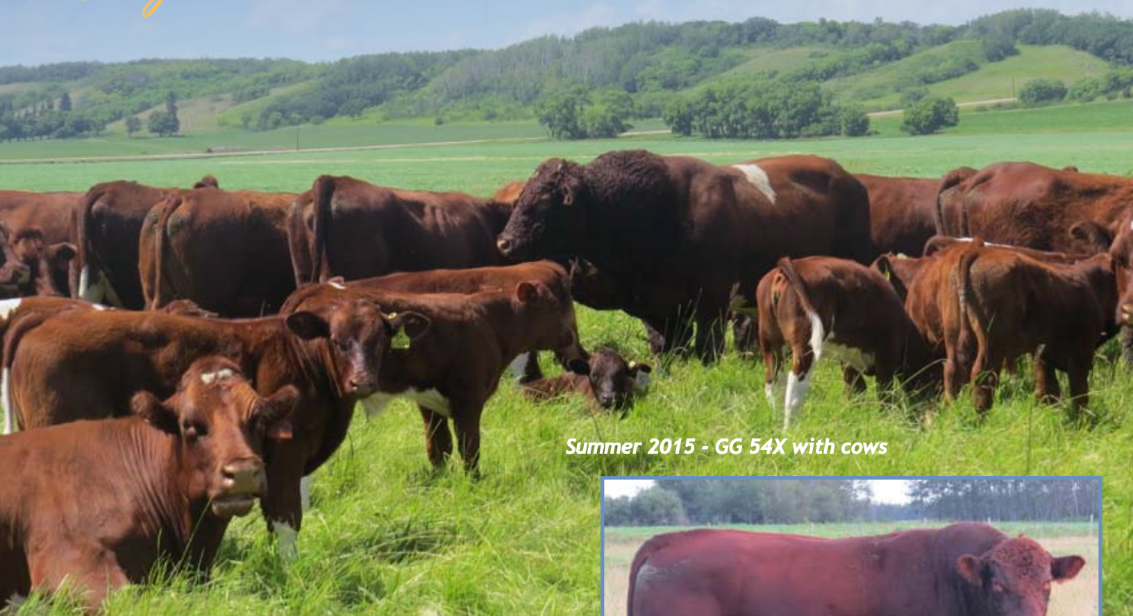
Summer 2015 - GG 54X with cows