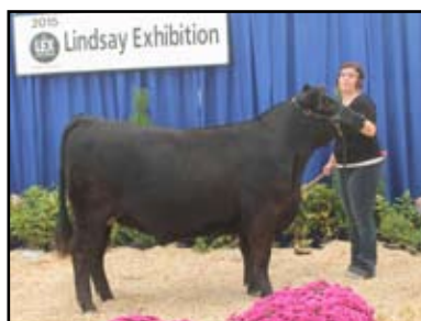
Champion Percentage Maine-Anjou Female