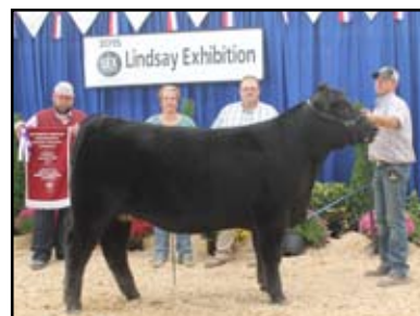
Reserve Grand Champion Maine-Anjou Female