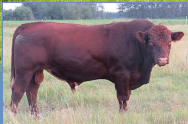
MAC's 18Z - Polled FB Herdsire - summer 2015 Progeny on test at Douglas Test Station