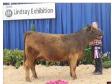
Reserve Champion Percentage Maine-Anjou Female