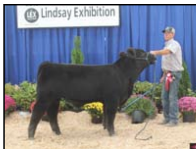
Reserve Grand Champion Maine-Anjou Bull