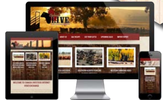
Custom & Responsive Websites