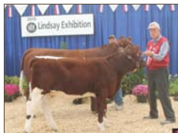
Senior Champion Female