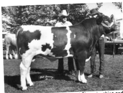
LW Challenger, 13 Grand Championships and 3 Supreme Championships, 1980-81