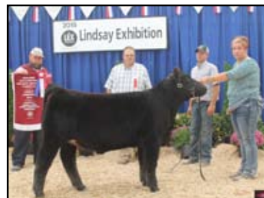
Grand Champion Maine-Anjou Female