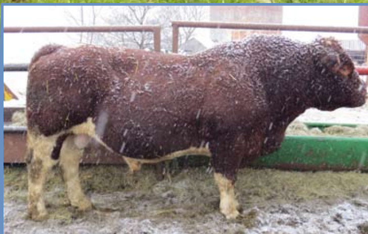
GG 54X - FB Herdsire Progeny on test at Douglas Test Station

Watch for our bulls & heifers at Douglas Bull Test Station Sale - April 2, 2016 Summer Sale - May 28, 2016