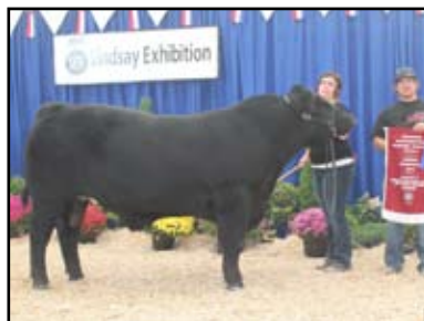
Grand Champion Maine-Anjou Bull