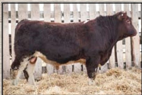
herdsire CWC ZORRO 42Z

featuring top quality fullblood bulls, heifers & semen from: