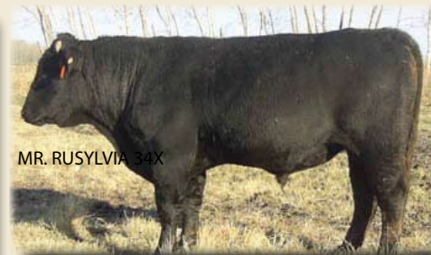
MR. RUSYLIVIA 34X

MAINE BULL SIRES Including: Riptide, Rusylivia 34X, Twister, Dragon, Aviator, Alphonso