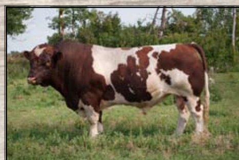
herdsire MELS BENZ 110X

CWC Cattle Co. Wildberry Hills Maine Anjou & Stenberg Maine Anjou